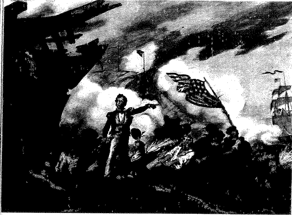
The United States gained control of Lake Erie during the War of 1812 as a result of the victory of naval forces under the leadership of Oliver Hazard Perry in 1813.