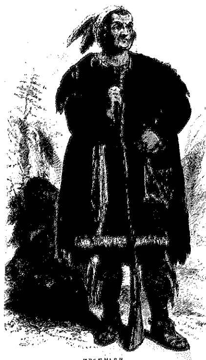
The Shawnee leader Tecumseh, pictured above, united Native Americans in an attempt to halt the advance of white settlers onto Indian lands.

Next the British attacked the port city of Baltimore. On September 13, an American lawyer named Francis Scott Key watched as the British bombarded Fort McHenry, which guarded the city's harbor. The bombardment went on all night. When dawn broke, Key was thrilled to see that the American flag still waved over the fort. He captured his feelings in a poem that was later put to music as "The Star-Spangled Banner."