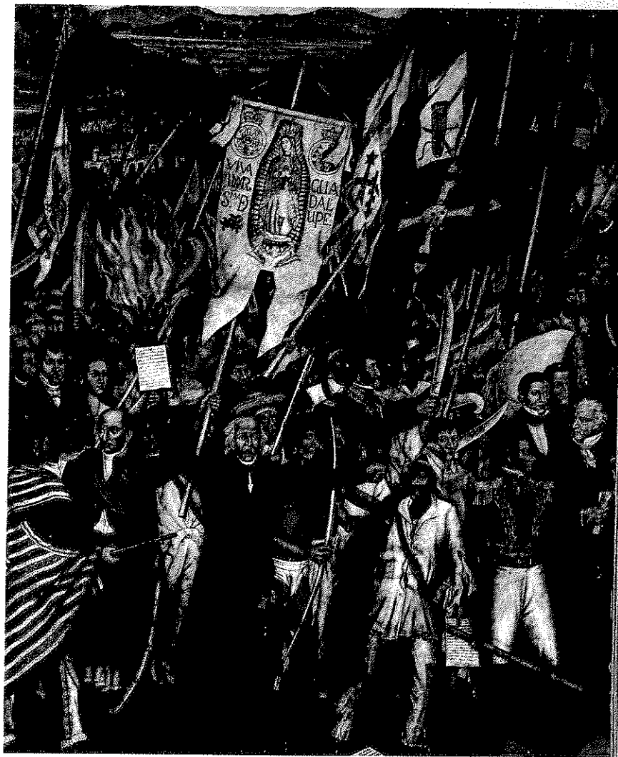
A Catholic priest, Miguel Hidalgo (lower center), inspired an independence movement in Mexico. In his upraised hand, Hidalgo holds the flames of revolution that spread throughout Latin America in the early 1800s.

President James Monroe asked former presidents Thomas Jefferson and James Madison for advice. Should the United States do something to support the new Latin American nations? If so, what?